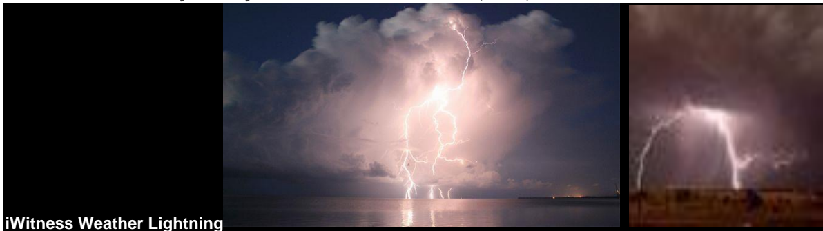
iWitness Weather Lightning

From the Florida Everglades.