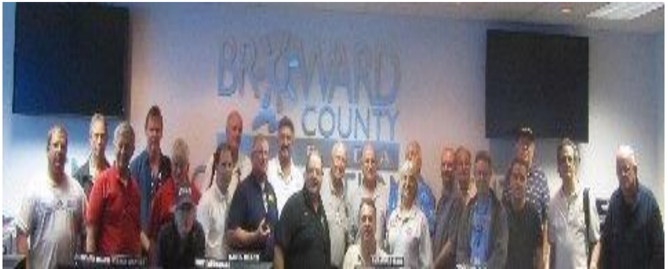
The amateurs that attended were (not in any order) were:

N4HHP, KD4FRB, KM2V, KE4YP, KJ4AWB, KK4SVU, N4JRW, KG6POW, KK4GUB, WB4JC, KI4IQZ, KK4GNU, N4JUP, W1MCG, KD2BMD, KC4WAM, K4MGW, WB2MBV, KG4DWP, KK4ENJ, K4ZXR, KJ4ZHO, KJ4WAG, AJ1O, AF4PL, K4FLL, KA2BYU